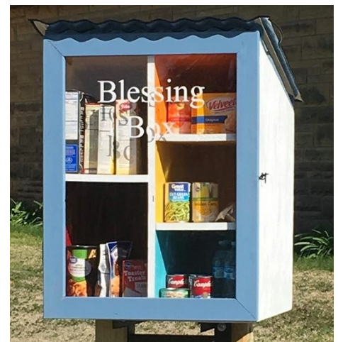
The Blessing Box at Hays Christian Church is located at 22nd and Marshall Road.

wishes to contribute to the stock of the Blessing Box may do so simply by dropping by and adding their contributions to the shelves.