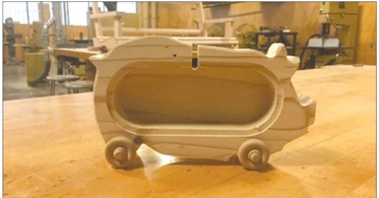
The Department of Applied Technology will be building 200 of these wooden piggy banks for children in Ellis County. In this photo, the acrylic front has not yet been applied. Community volunteers are need on Saturday, Dec. 1, to help with the project.